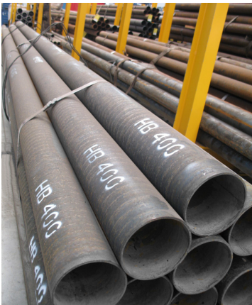
There are also available raw pipe: in rod